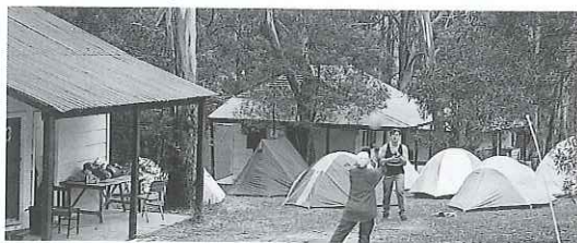
Campers enjoying some relaxation.