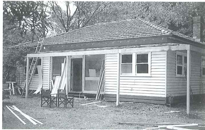
The office takes shape