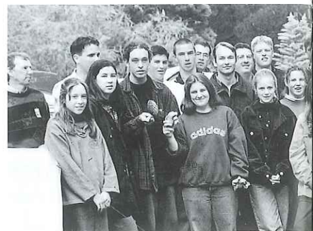
Some of the 60 young people at Meeniyah/D.