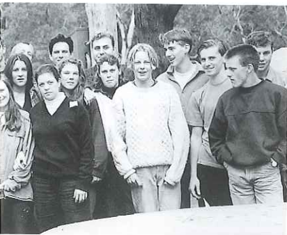
gley Camp, after packing to return home.

way David applied the Old and New Testaments.