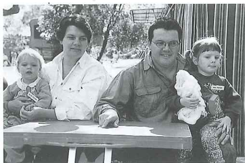
A young family enjoy the camping atmosphere.