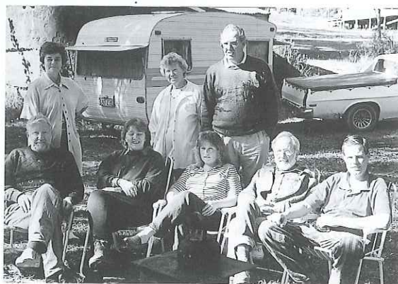
Family and friends catch up on old times!

course made the Convention meetings, particularly Summer and Easter, truly family occasions, while the Spring Convention had its special appeal for the young singles and young marrieds.