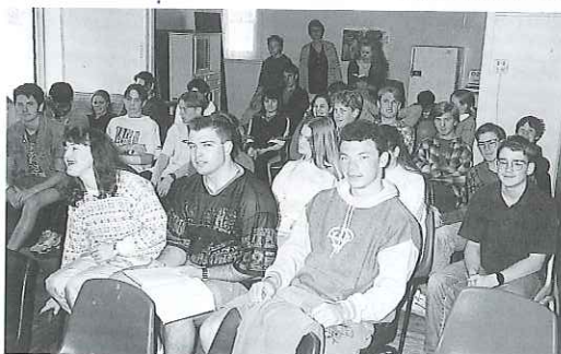
Young people at Master's Manor.

It was both exciting and encouraging to see people representative of every age group supporting the Convention meetings. This of