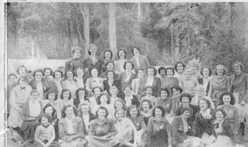
Campers at the last Convention.

Fraser & Morphet Pty. Ltd., Printers, Prahran.