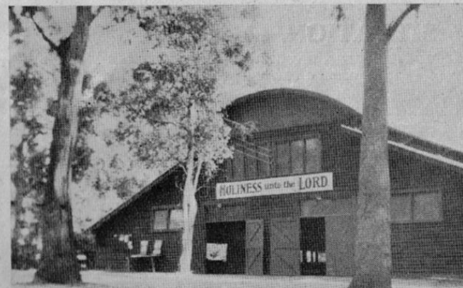
UPWEY CONVENTION HALL