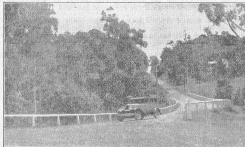
Collier Avenue (Tecoma end). The Convention Grounds are on top of the rise.

The TWENTIETH ANNUAL UPWEY CONVENTION will be held at Upwey, Victoria, from Friday, 24th December, 1937, till Sunday, 3rd January, 1938.